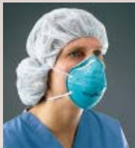
The 1860 Particulate Respirator may be used as a surgical mask.

The 3M 1860 particulate respirator and surgical mask has a soft inner shell for greater comfort against the face. And because it's fluid resistant, it aids in reducing the potential exposure of the wearer to blood and other body fluids.